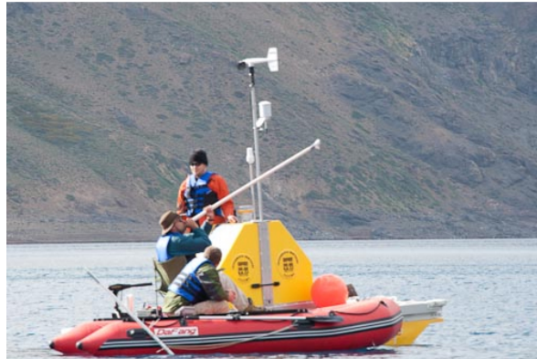
Figure 1. PLL towed to its position on Laguna Negra (33°39S/70°07W) in December 2011. The lake is 6 km x 2 km large and 300 m deep. PLL carries a meteorological station and a multisensor probe to monitor the lake physical characteristics and biology for the next 3 years.

ASTEP10-0011, and by funds from the Astrobiology Education and Public Outreach program. We are also extremely grateful to the Aguas Andinas Company, Santiago (Chile) for their overall support of the project and their assistance with the logistics of our deployments.